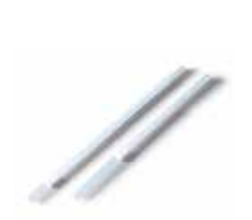
Telescoping filling tube FEP