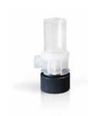
Dispensing cylinder with valve block