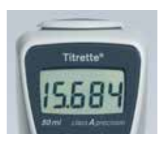
Precise working within the Class A error limits