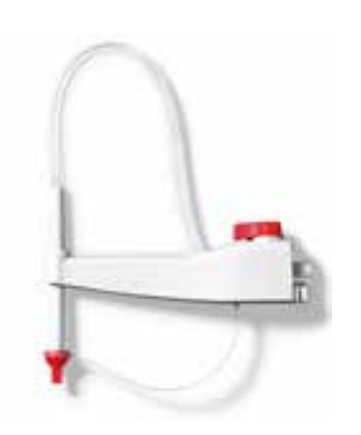
Titrating tube with screw cap and integrated discharge and recirculation valve

Original Titrette® accessories ensure optimal work conditions in the laboratory.