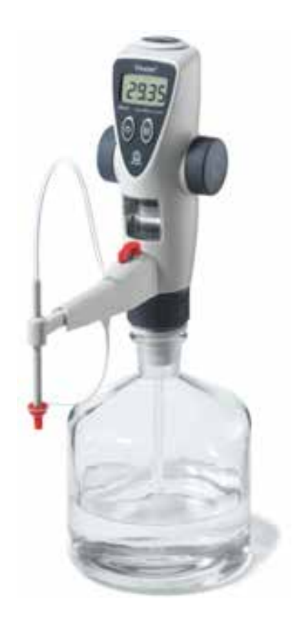
Titrette® Nominal volumes: 10 ml, 25 ml und 50 ml

The Titrette® is light and compact, and thanks to its robust design it can also be used where space is limited, with no power connection required. The compact design and low weight ensure high stability. The instrument can be disassembled in a matter of minutes – for cleaning, to replace the dispensing unit or to replace the batteries. And with Easy Calibration technology, you can make calibration adjustments on the instrument quickly and easily without any tools. Discover how easy and efficient precision titration can be with the Titrette® bottle-top burette.